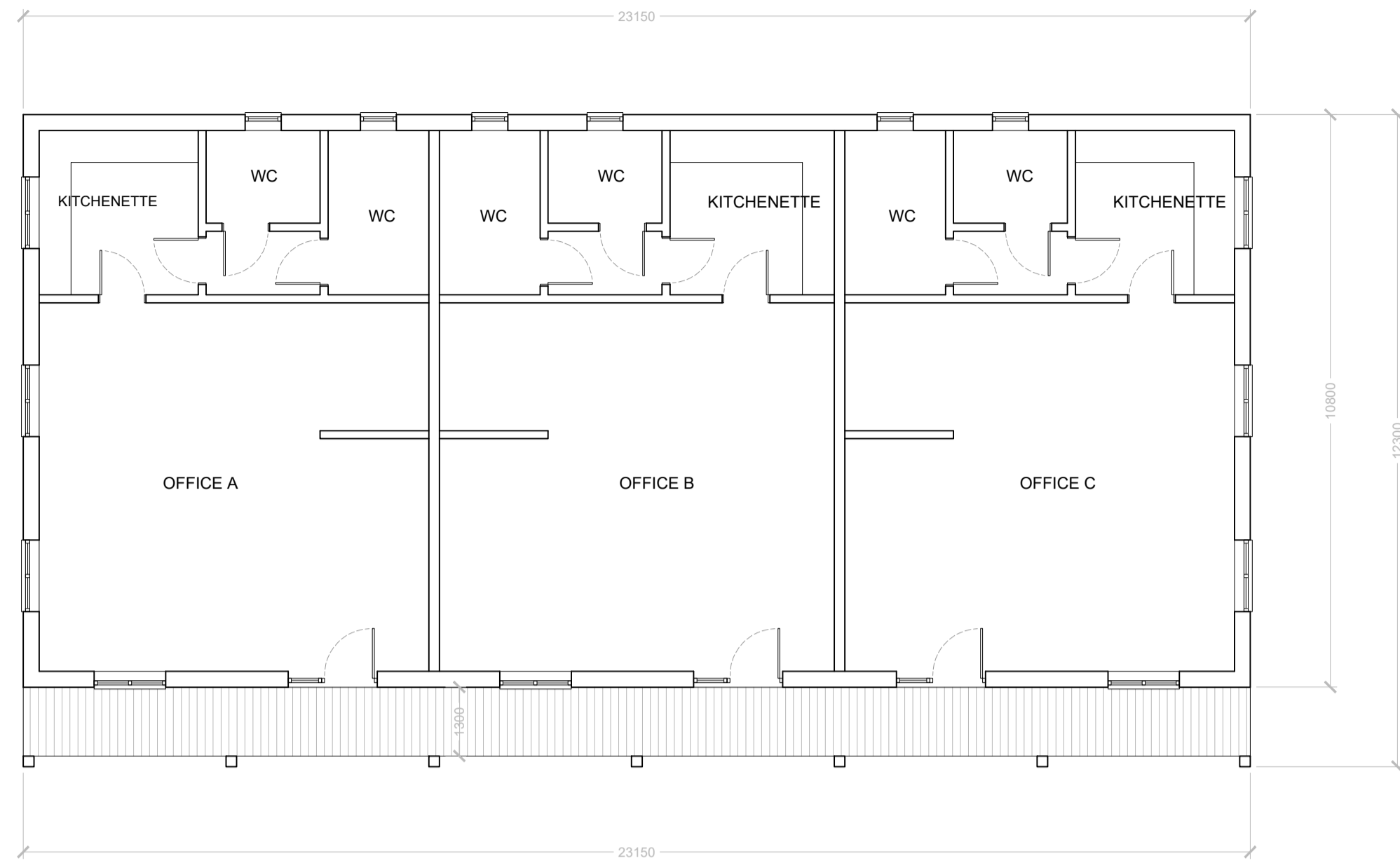
Ground Floor Plan 1:100